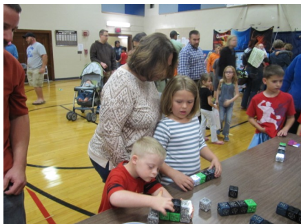
Family Science Night assembly funded through the Foundation.

$14,139 was awarded towards scholarships in 2016.