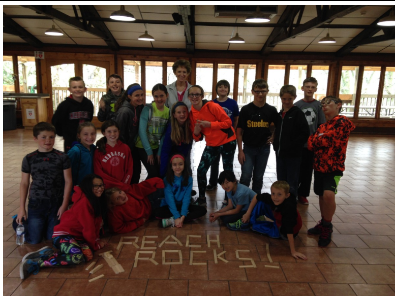
5th grade REACH students attending the Leadership Training at Camp Kitaki which was a grant funded through the AGPS Foundation.