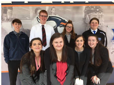
FBLA students competed at the Midland Business Competition in preparation for the State Leadership Conference.