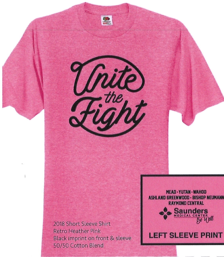
2018 Short Sleeve Shirt Retro Heather Pink Black imprint on front & sleeve 50/50 Cotton Blend